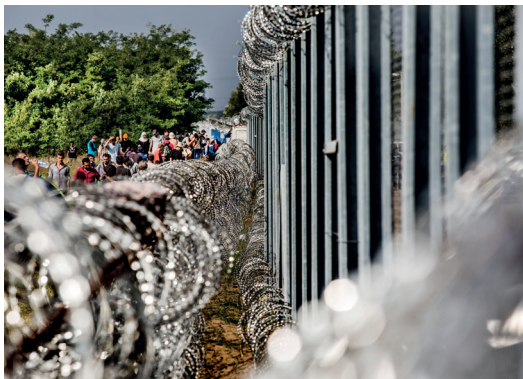
Refugees at the Hungary-Serbia border fence, 2015

— Migration Commissioner Dimitris Avramopoulos, March 2015. 1