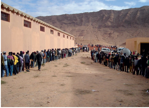
Hundreds of migrants abandoned in the desert by the Moroccan authorities, 2005

"In September 2012, 43 injured people arrived at MSF's office in Oujda. They told MSF how they were part of a large group who had succeeded in entering Melilla but were caught by the Guardia Civil who used rubber bullets and electric batons to apprehend them, and then handed over the Moroccan security forces who beat them. More than half needed immediate medical care, including 8 who had to be hospitalised. Another man arrived the next day, hit by a rubber bullet and blinded in one eye. He had been in the same group but it took him longer to reach MSF due to the severity of his injuries."