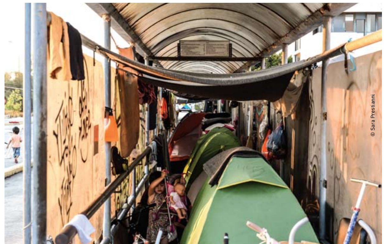
Elliniko / August 2016

Relocation should also be strengthened and speeded-up: whereas in September 2015, the European Union pledged to relocate 66,400 people from Greece, this has not been translated into practice. As of the 14th October, of the meagre 16,532 places pledged by EU Member states for relocation, only 4,716 persons have been relocated from Greece.