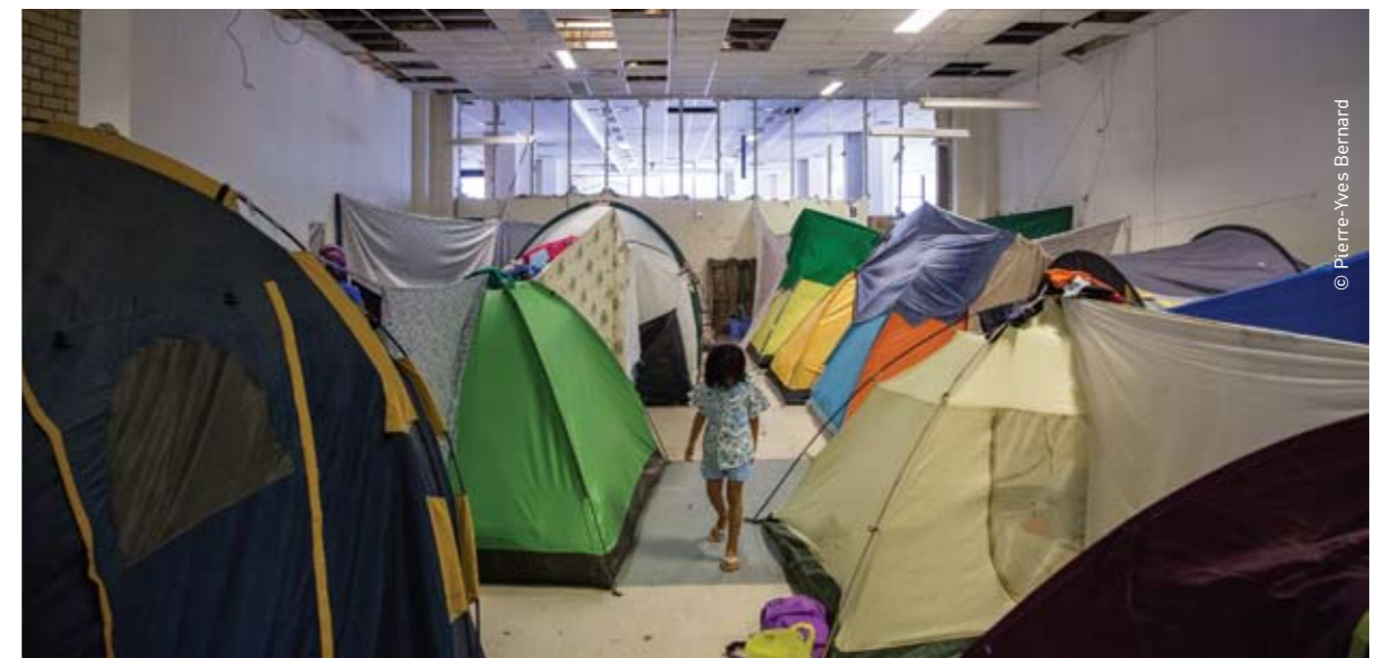
Elliniko / June 2016

On the mainland, the Greek Asylum Service (GAS), UNHCR and EASO started a pre-registration exercise on June 8th in order to overcome a backlog of pending registrations, and to identify the profiles of the people present in Greece. As of July 30th, out of 27,592 persons, 3,481 persons were identified as vulnerable as per Greek law 3 , that is 12,6% of those who were pre-registered at that time. MSF has repeatedly raised concerns that people with less visible vulnerabilities remained unidentified during the exercise. Though a 5 day training course was conducted for those participating in the pre-registration exercise; it remains difficult for un-specialised people in the course of short interviews conducted in non-private spaces to identify vulnerabilities such as victims of sexual violence, trafficking, torture or those with mental health disorders.