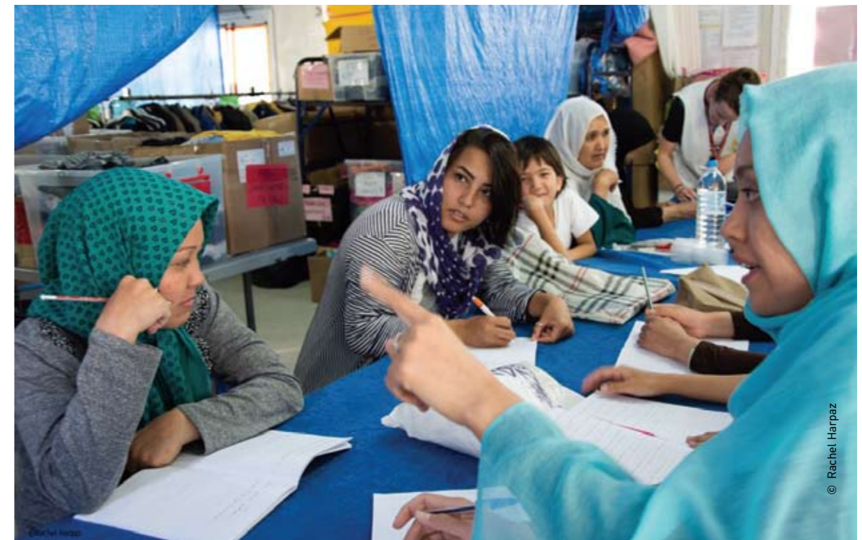
Samos / September 2016

cal interventions her role as a mother was reinforced and she rediscovered all the coping skills and strategies that were already available to her but she was not aware of. The stress gradually subsided and she is now more calm and confident, the suicidal ideation is not present anymore and she is more optimistic concerning her future and that of her family.