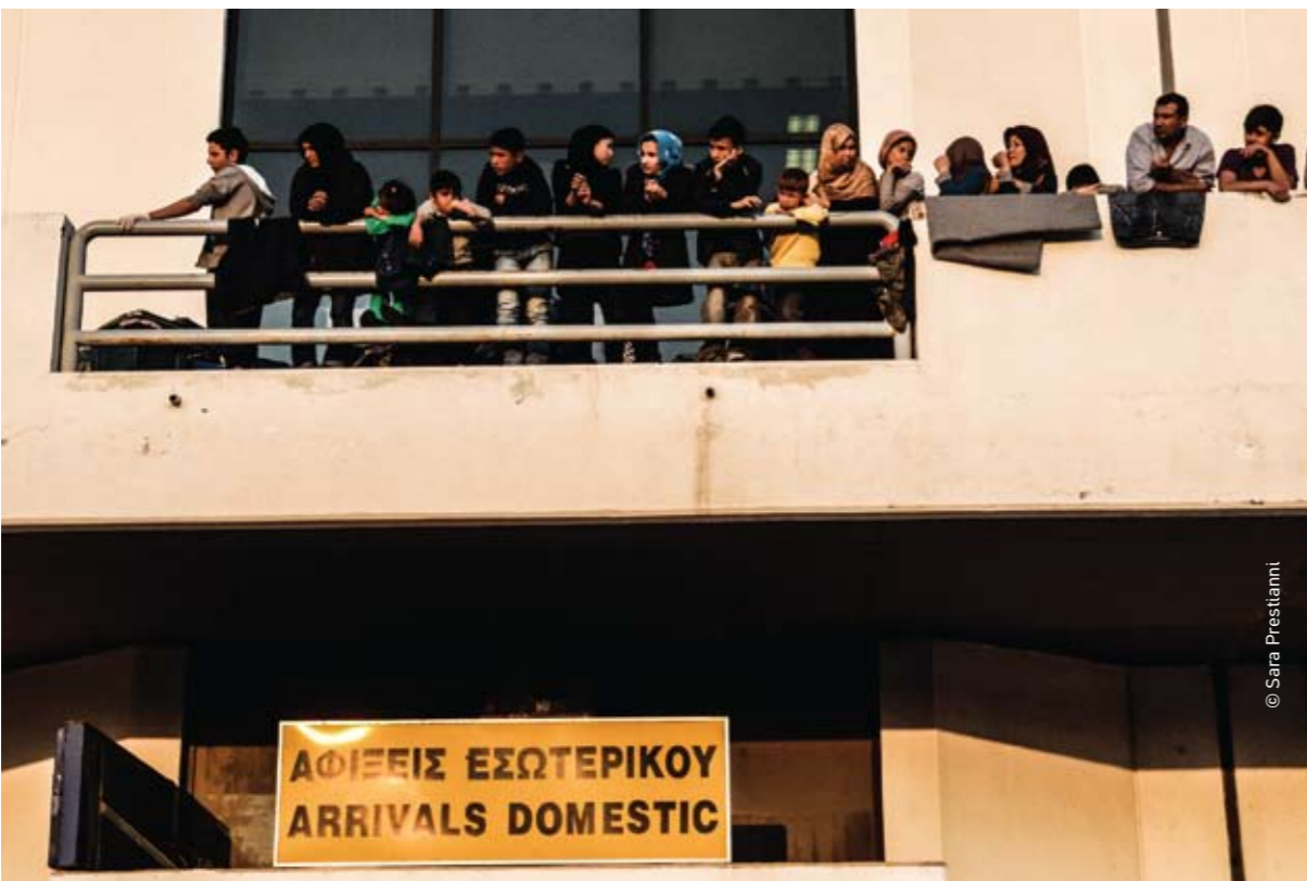
Elliniko / August 2016

Seven months after the closure of the border with FYROM, more than 50,000 people are currently stranded in Greece of which over 15,000 on the islands. As though that weren't enough, the implementation of the EU-Turkey statement at the end of March 2016 has strengthened the policy of deterrence run by the EU by putting in place an organized way to deny access to a safe environment to those having fled war-torn countries and in search of protection.