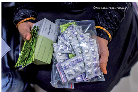
A DR-TB patient showing her TB medication in Mumbai, India.

endTB's clinical trial (a partnership between MSF, Partners in Health, Epicentre, Harvard Medical School and the Institute of Tropical Medicine Antwerp, financed by UNITAID), of which MSF is sponsor, will begin in late 2016. In collaboration with ministries of health, the clinical trial will involve 750 patients in six countries (potential sites include Georgia, Kazakhstan, Kyrgyzstan, Lesotho, Peru, South Africa), of which Georgia, Kyrgyzstan and South Africa are MSF projects. It will study the safety and efficacy of several "user-friendly" MDR-TB treatment regimens, each containing either bedaquiline, delamanid or both, in combination with old or repurposed drugs, for nine months, and without injectables.