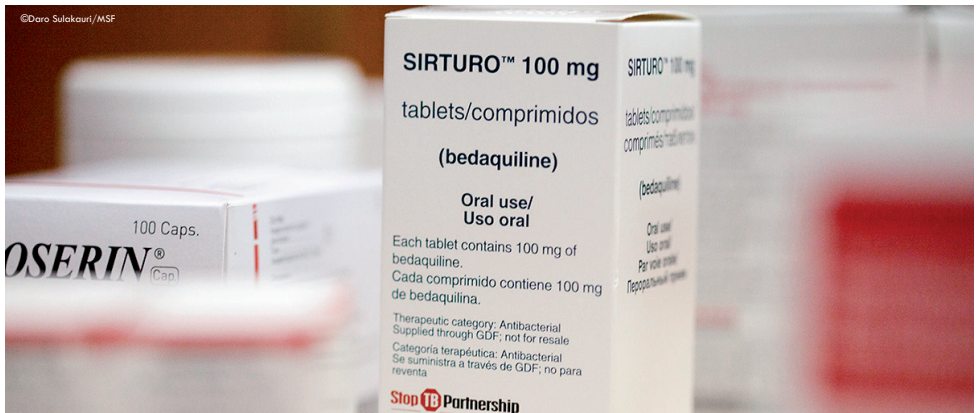
Bedaquiline, one of the new antibiotic drugs used to treat DR-TB at the National Centre for Tuberculosis and Lung Disease in Tbilisi, Georgia.

MSF is one of the biggest non-governmental providers of TB treatment care - including for DR-TB - in the world. MSF has TB treatment projects in 24 countries around the world, and in 2015 supported more than 20,000 TB patients on treatment, including 2,000 patients with DR-TB.